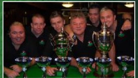
Cambrian Cuers - Team Champions 2008