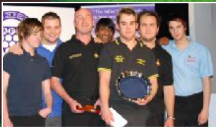
Haircut Promotions - Plate Winners 2008